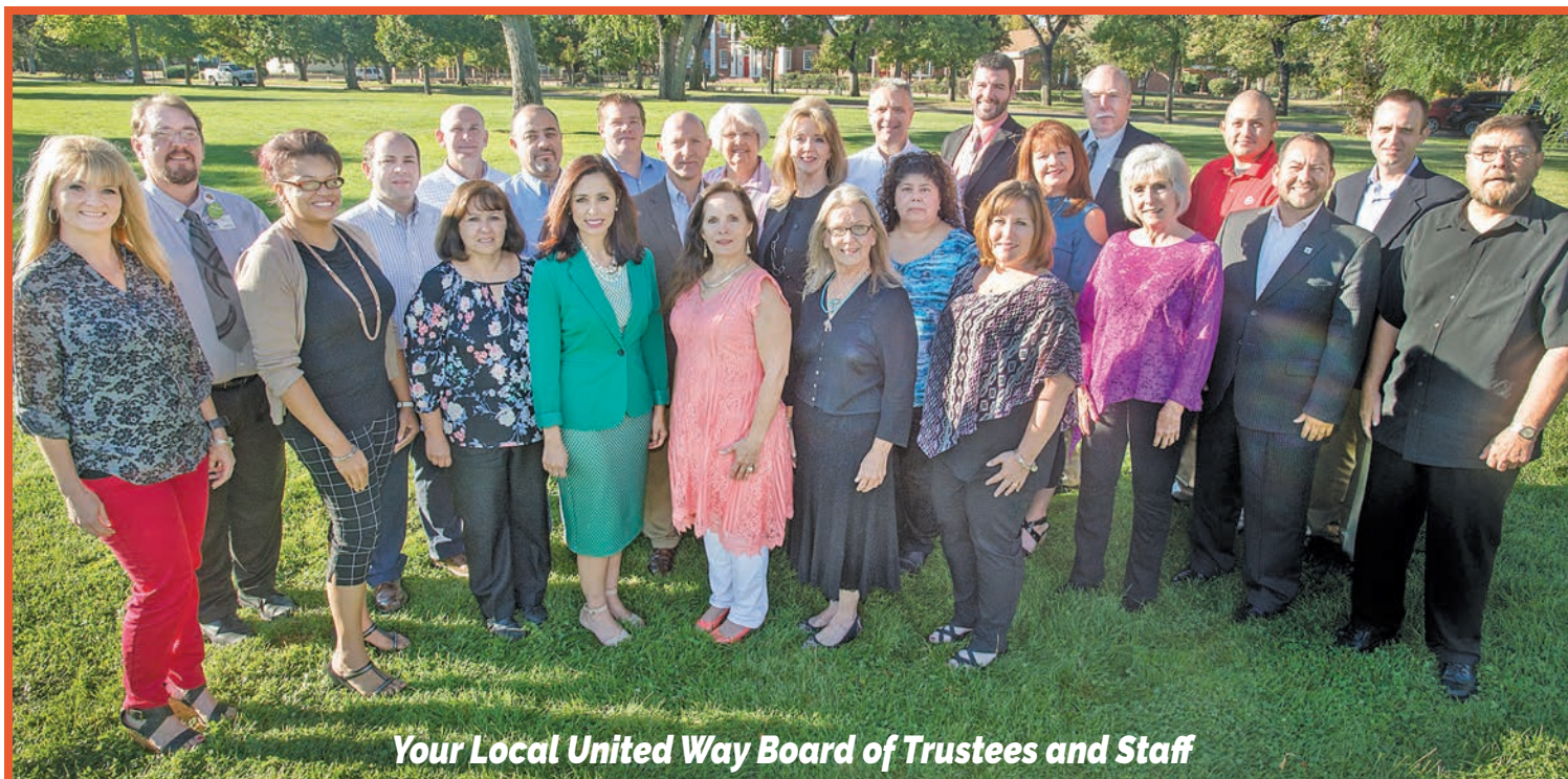
Your Local United Way Board of Trustees and Staff